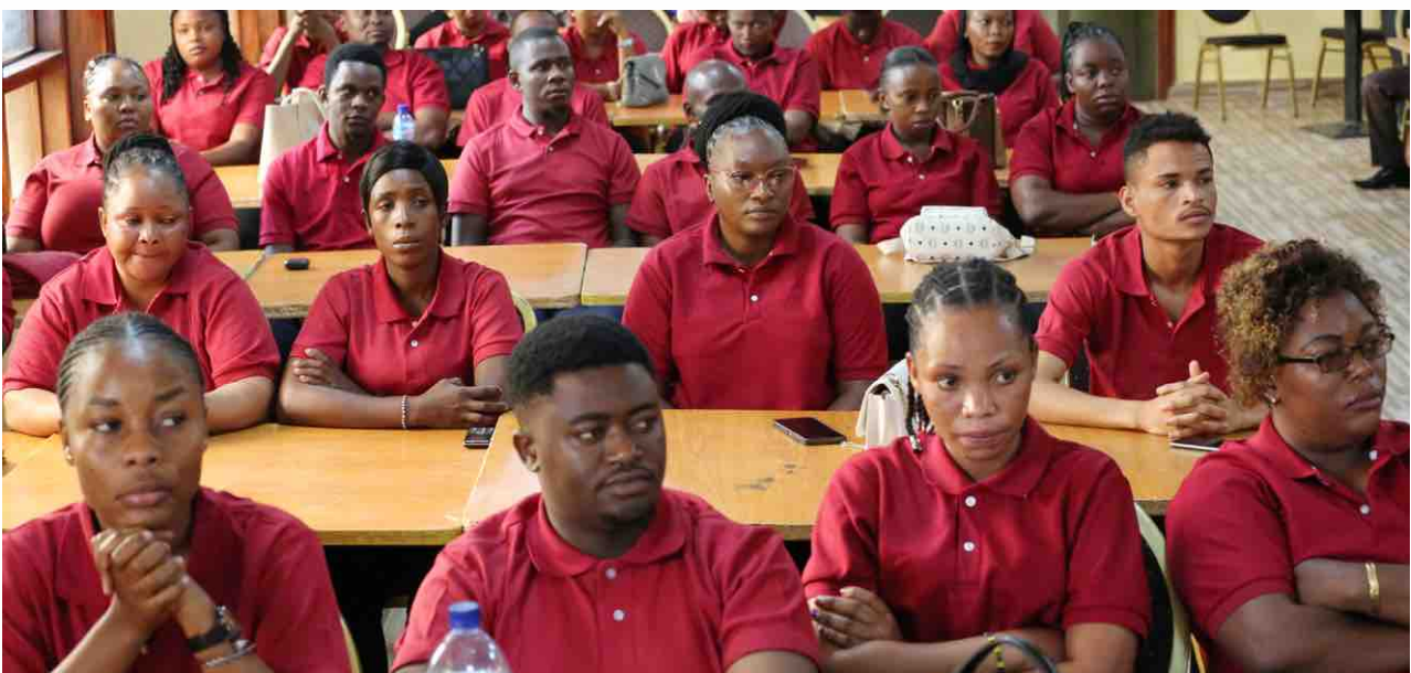
Participants of the Bus Passenger Customer Service Training Course in a class session

The course is among of the activities implemented under the Centre of Excellence in Aviation and Transport Operation through Eastern Africa Skills for Transformation and Regional Integration Project (EASTRIP) funded by the World Bank.