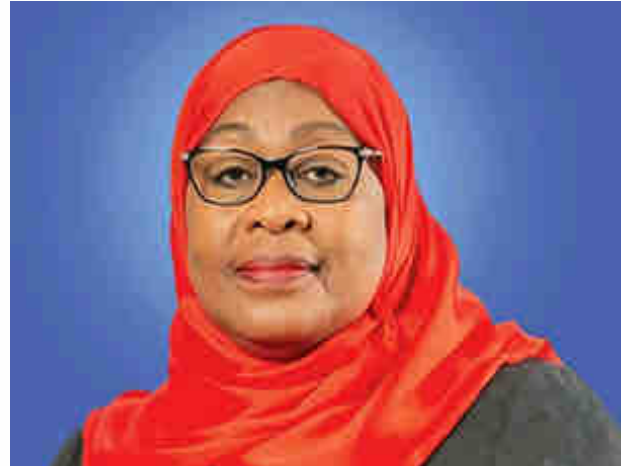
Hon. Dr. Samia Suluhu Hassan, The President of the United Republic of Tanzania

of the modern training equipment at NIT like VMT and Aircraft Engineering System Trainers has enabled the Institute to secure an approved training organization certificate (ATO) for diploma in aircraft maintenance engineering programme from Tanzania Civil Aviation Authority (TCAA).